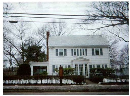
Neighboring Building to left of 1445 Centre St File Photo