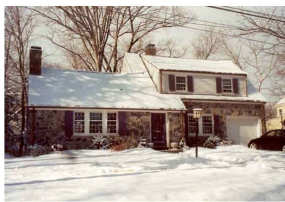
24 Nickerson Road - Feb. 2001

<u>24 Nickerson Road</u> - This 1941 Cape Cod cottage is a good example of where a house was given the protection of demolition delay based on its high quality architectural character and context. Surrounded by similarly styled and scaled buildings, its loss would have certainly impaired the cohesiveness of the neighborhood. The 5 unanimous votes of Commission Members to find the house "Preferably Preserved" confirm this understanding. It appears from