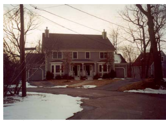
69 Webster Park - Feb. 2001