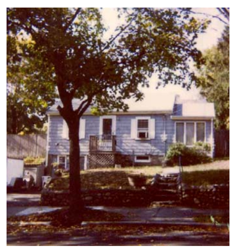
39 Fernwood Road - File Photo

1445 Centre Street - In contrast to the above example, this property is one where the Commission by a 5 to 0 vote in 1998, upheld the demolition delay on a high quality 1925 Craftsman bungalow. The reason this is problematic is that the request was to remove the roof to allow for the addition of a second floor in a neighborhood context where the building is surrounded by larger two-story dwellings. This raises the issue of whether historic buildings can be altered in any way and if the Commission is following the Secretary of Interior Standards in reviewing proposed changes. Rather than being able to directly address the issue of sensitive alterations, the Commission seems to be backed into a corner of determining only whether a historic residence can or can't be altered. In a case such as this, a more reasonable approach may have been to give more precise direction as to what kinds of alterations would be found acceptable. A site visit revealed that the dwelling remains unaltered after three years and in good condition, a testimony to its continuing functionality.