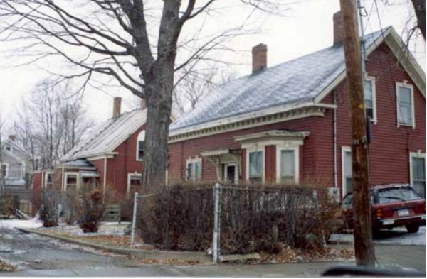
29 Pearl Street - File Photo