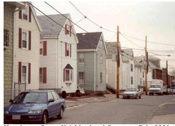
Hawthorne Street Neighborhood Context - Feb. 2001

78 Hawthorne Street – Back in 1991, this c1912 three-story building, constructed of rough-faced concrete block, was reviewed by the NHC. A request was made for partial demolition impacting the porch, balconies and roof. The Commission determined that the building was "Historic" but allowed that the seriously deteriorated wooden appurtenances were "Not Preferably Preserved." It is unclear from the file whether the Commission was involved in any real review of the design of the replacement balconies, but the results in place 10 years later clearly provided for the ongoing use of the historic property and demonstrates how a modern approach to the design of reconstructed elements can still be sensitive to the scale and original architectural character of the building. The 78 Hawthorne Street building, in its prominent corner location, continues to anchor this largely intact working class neighborhood made up of modest, homestead style frame dwellings.