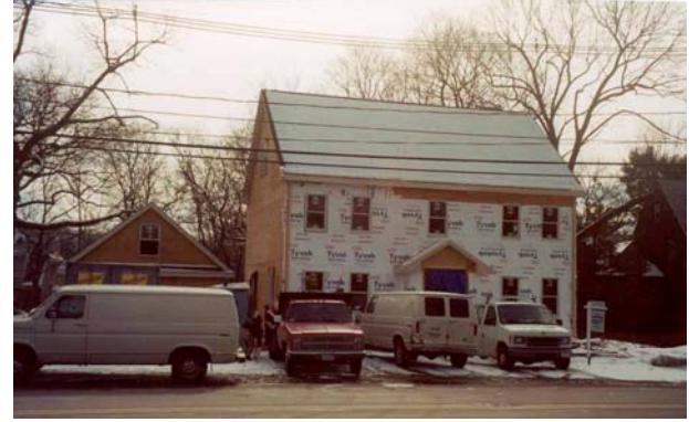
1964 Beacon Street - File Photo