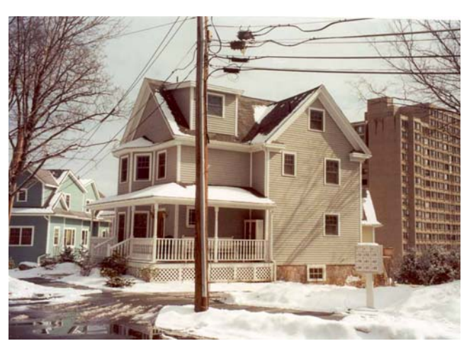
73 Beecher Place - Feb. 2001

73 Beecher Place – Older buildings, such as this c1885 Queen Anne residence seem to be more often protected than those dating to the early- to mid-20<sup>th</sup> century. In this case, the NHC voted 4-0 in March 1995 to find the house both "Historic" and "Preferably Preserved." That evidently was the end of the matter, and though the demolition delay expired in six months later, the building remains today, a substantial