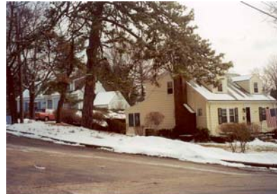
Cape Cods to left of 11 Bunny Circle Feb. 2001