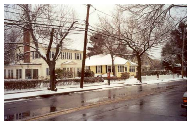
1445 Centre Street (on Right) - Feb. 2001 Photo

1445 Centre Street - In contrast to the above example, this property is one where the Commission by a 5 to 0 vote in 1998, upheld the demolition delay on a high quality 1925 Craftsman bungalow. The reason this is problematic is that the request was to remove the roof to allow for the addition of a second floor in a neighborhood context where the building is surrounded by larger two-story dwellings. This raises the issue of whether historic buildings can be altered in any way and if the Commission is following the Secretary of Interior Standards in reviewing proposed changes. Rather than being able to directly address the issue of sensitive alterations, the Commission seems to be backed into a corner of determining only whether a historic residence can or can't be altered. In a case such as this, a more reasonable approach may have been to give more precise direction as to what kinds of alterations would be found acceptable. A site visit revealed that the dwelling remains unaltered after three years and in good condition, a testimony to its continuing functionality.