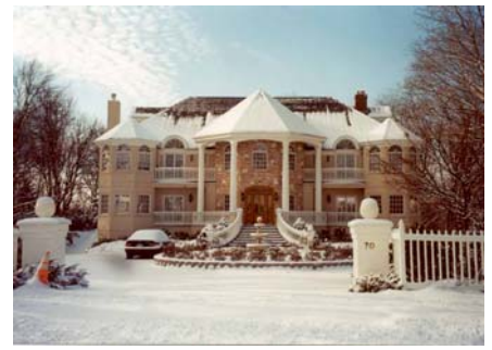
Replacement Building for Bungalow at 72 Charlemont St. - Feb. 2001

<u>72 Charlemont Street</u> - This 1996 request for demolition of a 1920s bungalow is one more of numerous examples of early-20<sup>th</sup> century neighborhoods being disconcertingly altered by newer, out-of-scale developments. In this case the rationale cited for finding the dwelling "Not Preferably Preserved," that it "...does not contribute to the streetscape and neighborhood," is questionable. This is illustrated by the photos presented here. Interestingly, the home itself was found to be "Historic" unlike the one described in the next example.