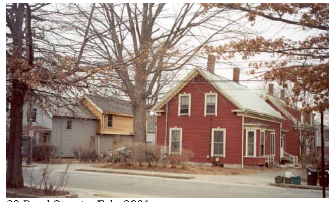
29 Pearl Street – Feb. 2001

29 Pearl Street - On February 5, 1998, three members of the of the NHC voted unanimously to find the two modest mid-19<sup>th</sup> century vernacular cottages on this property "Historic." One month later, the request to waive the one-year demolition delay was denied by a unanimous 5 to 0 vote with the comment that plans submitted for replacement construction were not consistent in size and scale with the fabric of the neighborhood. Three years later, the two properties are extant and reveal investment in the property with an addition to one of the dwellings. This property was surveyed in January of 1977, providing historical background for the property and a clear basis for the NHC's decision.