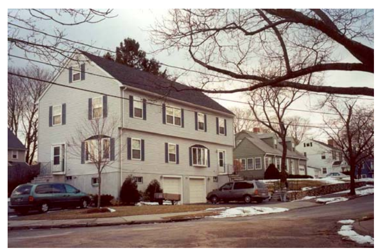
39 Fernwood Road - Feb. 2001

<u>39 Fernwood Road</u> - The home in question here was one of a neighborhood full of Cape Cod homes built in the 1940s. In 1996 this home was considered "Not Historic" and "Not Preferably Preserved" in a determination made by staff to the