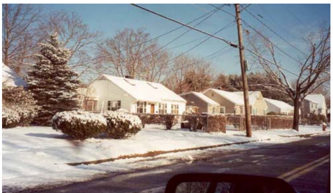
Saw mill Brook Parkway - Context - Feb. 2001

581 Saw Mill Brook Parkway - This Oak Hill Park dwelling was reviewed in May 2000. Demolition was requested for the garage, which was still extant as of February 2001. Here the issue is a questionable finding by the NHC, as indicated by its resolution to "find the attached one-car garage to be 'Not