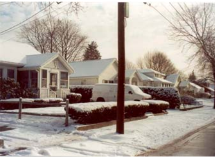
Charlemont St.– Neighborhood Context Feb. 2001