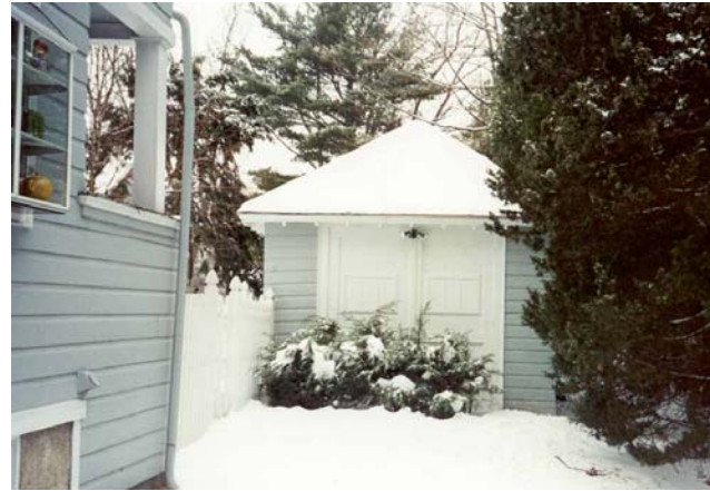
House at 91 Waban Avenue - File Photo