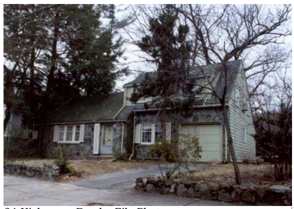
24 Nickerson Road - File Photo

78 Hawthorne Street – Back in 1991, this c1912 three-story building, constructed of rough-faced concrete block, was reviewed by the NHC. A request was made for partial demolition impacting the porch, balconies and roof. The Commission determined that the building was "Historic" but allowed that the seriously deteriorated wooden appurtenances were "Not Preferably Preserved." It is unclear from the file whether the Commission was involved in any real review of the design of the replacement balconies, but the results in place 10 years later clearly provided for the ongoing use of the historic property and demonstrates how a modern approach to the design of reconstructed elements can still be sensitive to the scale and original architectural character of the building. The 78 Hawthorne Street building, in its prominent corner location, continues to anchor this largely intact working class neighborhood made up of modest, homestead style frame dwellings.