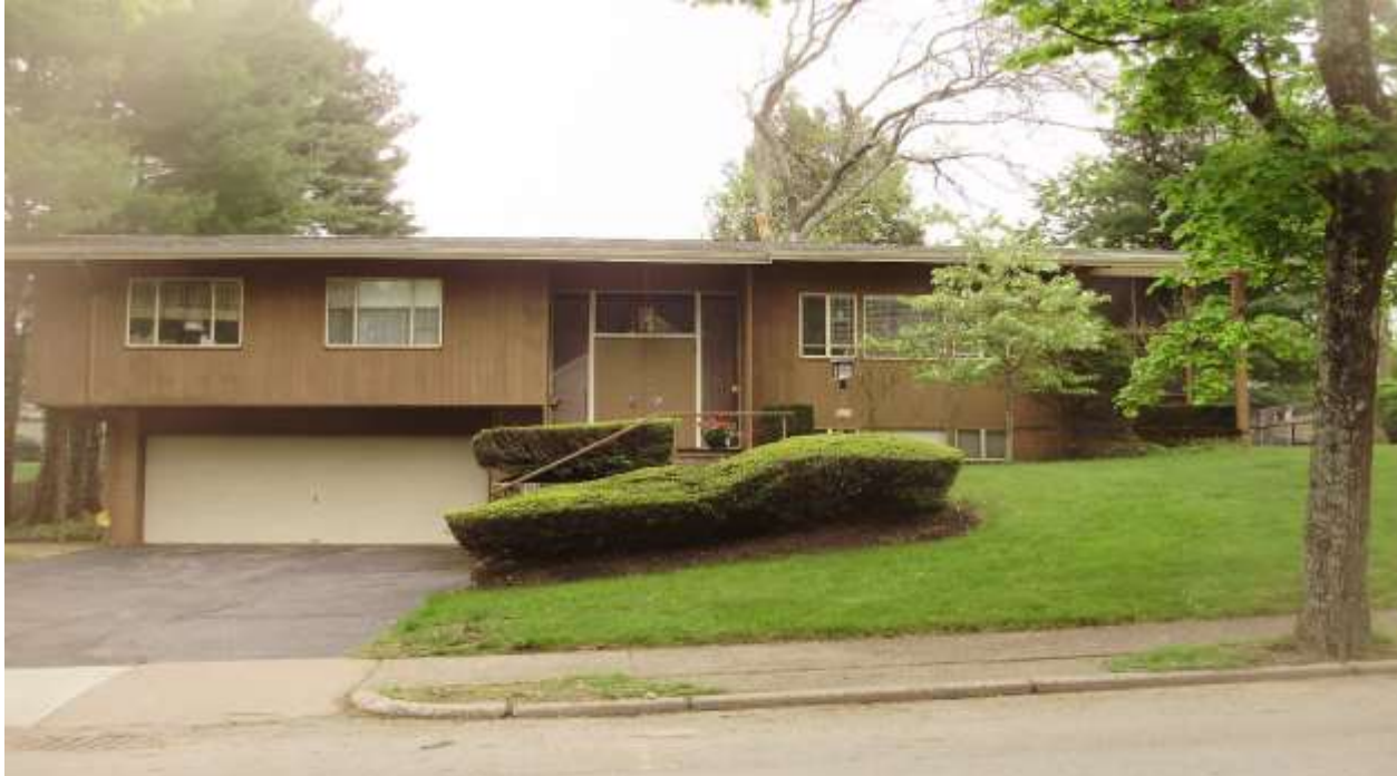
180 Allen Avenue

It may be possible to survey additional properties built between 1946-1970. However, a continuous survey would either need annual funding to hire a consultant or a trained group of organized volunteers. Both scenarios would be constrained by the number of properties that could be assessed during a given time period.