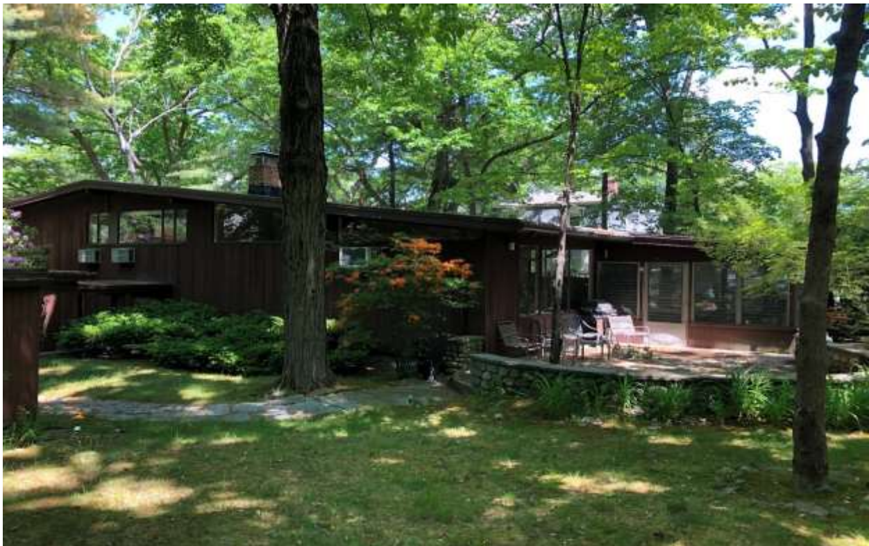
176 Highland Avenue (Compton & Pierce)

City-wide surveys have been conducted for many years in Newton but largely focused on pre-war architecture. A Mid-Century Modern survey conducted in Newton in the 1980s and 1990s missed several properties that have since come before the NHC for demolition review and were preferably preserved. This makes sense, because when these surveys were conducted, many of the buildings the NHC is now reviewing for significance were only 20 years old at the time. Recent examples of post-war historically significant buildings that were preferably preserved by the NHC include designs by Stanley Myers, Compton & Pierce, Samuel Glaser, and other mid-century architects who only recently became noted for their architectural contributions in New England. Recognition of this architectural period has reached the national level.